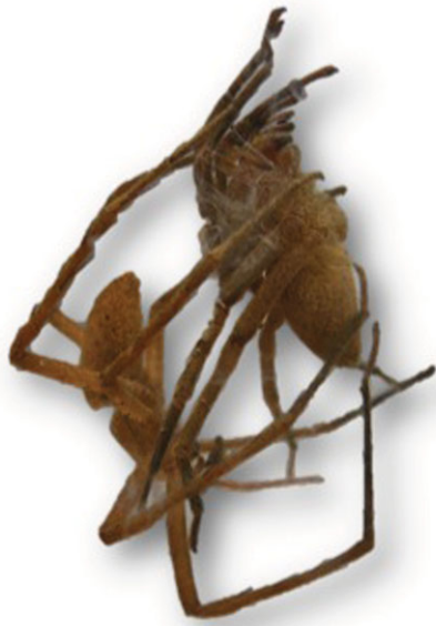
Figure 1. Male Pisaurina mira wrapping female with silk prior to copulation. (Online version in colour.)

spiders [13]. Additionally, larger male fishing spiders ( Dolomedes fimbriatus ) are more successful in avoiding cannibalistic attempts by females [14]. Many species with SSD, however, are not cannibalistic and the cause/effect relationship between SSD and sexual cannibalism is not well understood. Unusual behaviours such as death feigning [15], opportunistically mating with feeding females [16,17] and rendering females unconscious with sedative pheromones [18] are also presumably associated with avoiding sexual cannibalism. This study focuses on another particularly unusual mating behaviour—the wrapping of females in silk by males in the sexually dimorphic nursery web spider Pisaurina mira (Walchenaer).