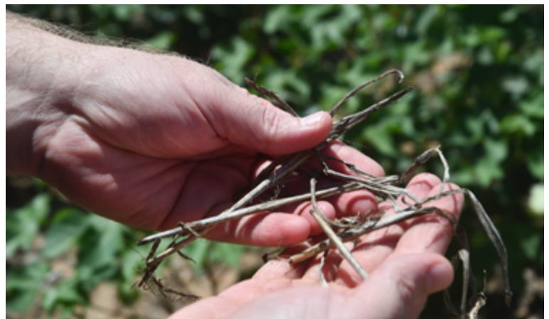
Early cover crop termination can result in residue that rapidly degrades or blows away.

“Although soil organic matter is slow to build up in our environments, we have seen more immediate impacts off cover crops on soil physical properties such as soil strength and infiltration,” he said. “Within the Rolling Plains, we have not observed depleted soil moisture behind cover crops during wheat and cotton growing seasons in dryland cropping systems.”