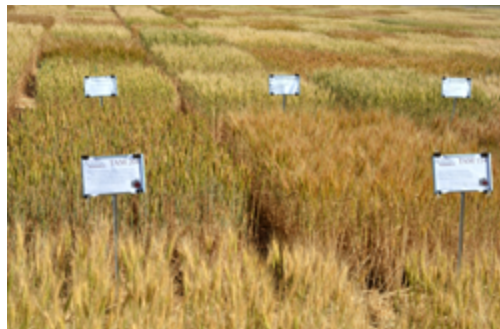
Wheat variety trials similar to this one are grown around the state by Texas A&M AgriLife Research breeders.

dual purpose and grazing wheats. TAM 204, TAM 401 and Razor are beardless wheats that don’t always make grain-only standards, but they all produce excellent forage.