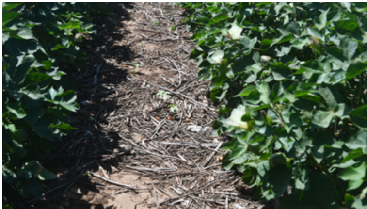
Waiting to terminate a cover crop leaves lasting residue.