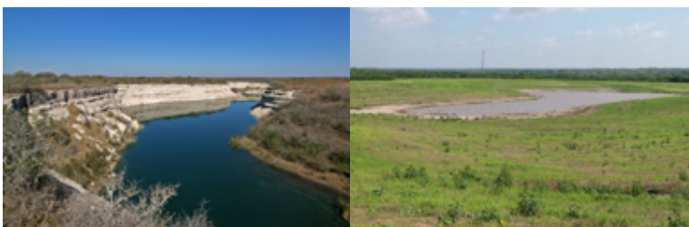
These photos show the Brown uranium mine in Karnes County before and after reclamation.

Texas A&M AgriLife Research and AgriLife Extension personnel who worked with reclamation decided to hold a conference to pull all the coal mining and reclamation players together to discuss reclamation processes and their advantages and disadvantages.