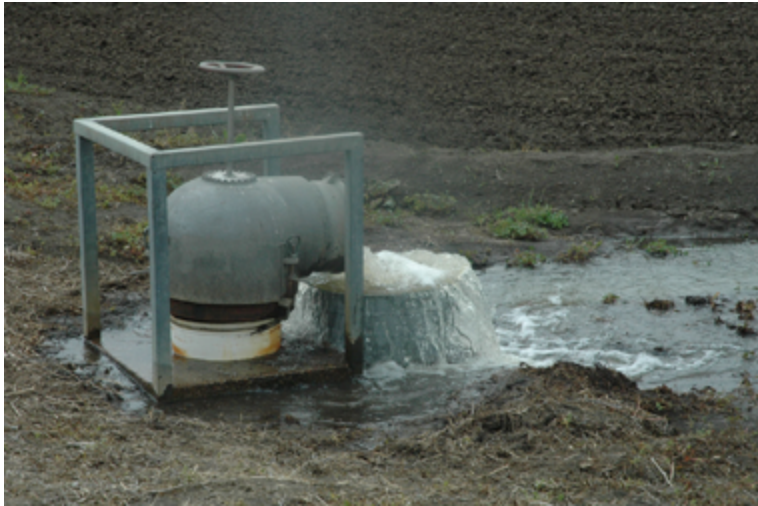
Private water well owners whose wells flooded due to recent rains from Hurricane Harvey should assume their well water is contaminated until they have it tested.

“You should not use water from a flooded well for drinking, cooking, making ice, brushing your teeth or even bathing until you are satisfied that it is not contaminated,” Boellstorff said.