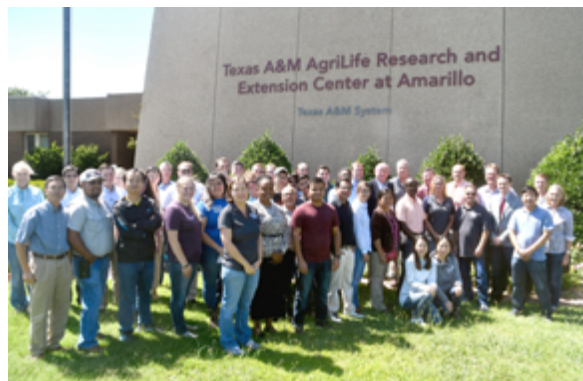
Faculty, staff and students involved with wheat and other small grains met in Amarillo in August to discuss research and issues impacting small grains.

The Small Grains Workers held their annual summer meeting at the Texas A&M AgriLife Research and Extension Center in Amarillo on August 10 and 11. Approximately 45 faculty, staff and students were in attendance.