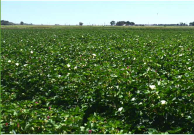
The bottom forefront shows irrigation after flowering compared to the top portion where early water promoted more plant growth but not necessarily greater yields.

Almost five years of data indicate producers can save as much as 40 percent of their water on a cotton crop by better timing their irrigation, according to a Texas A&M AgriLife Research scientist.