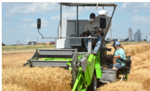
Wheat variety plots are harvested individually to provide yield performance data annually.

A Pick variety means this: “Given the data, these are the varieties we would choose to include and emphasize on our farm for wheat grain production in a particular region,” according to the Texas A&M AgriLife Extension Service specialists.