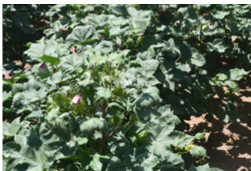
Chemical drift can damage cotton under these new technologies.