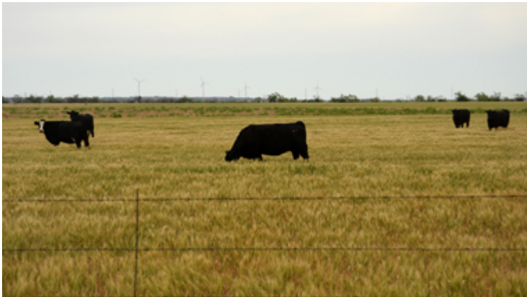
Grazing cattle on wheat could be an increasingly popular option for producers as wheat prices remain low.