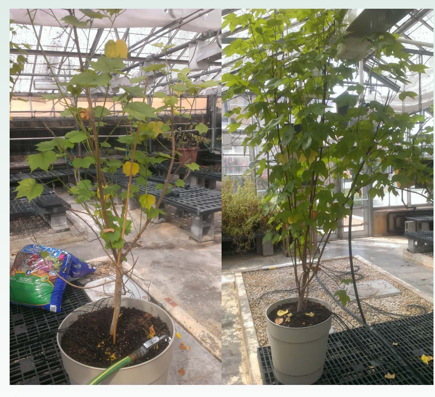
Gossypium barbadense cotton plant (left) & Gossypium hirsutum cotton plant (right)