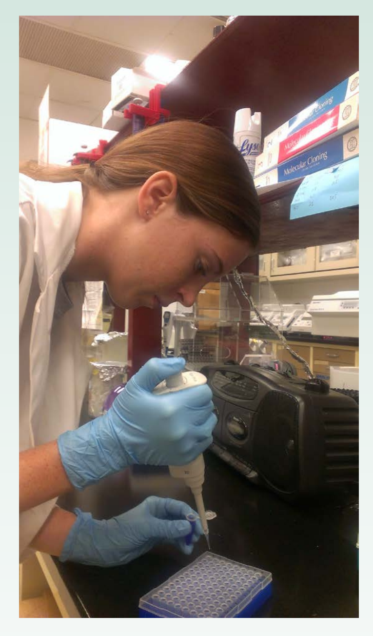
Preparing DNA samples for a mupid gel