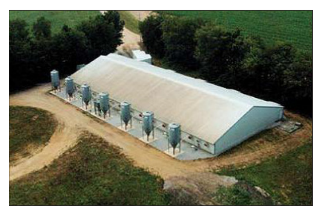
Figure 4. A windbreak around a swine barn.

Studies show that dust and odorous gases in the exhaust air from liquid manure pit fans or from ventilated livestock and swine buildings can be reduced by 50 to 90 percent with biofilters that filter and treat the air.<sup>5,7</sup> Biofilters are usually