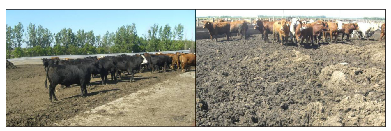
Figure 3. The feedlot surface on the left is well drained and properly managed, while the surface on the right is poorly managed.

4 hours before and after sunset when animals are most active.