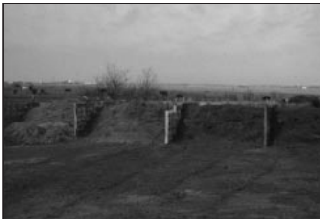
A simple, well-managed composting system is visually appealing and is unlikely to cause water quality problems.

The moisture content of the manure and bedding is normally 50 to 60 percent in the raw state, so additional moisture probably will be unnecessary until the compost is moved to the second or third bin. Have an ample water supply and pressure to moisten the compost as it is turned. Moisture content can drop as low as 25 percent within 4 weeks. To increase the moisture content of compost from 25 percent to 55 percent, add about 20 to 30 gallons of water per 100 cubic feet of compost. For a system in which four bins (1,000 cubic feet each) require additional moisture, approximately 1,200 gallons of water are needed every time the bins are turned. However, the actual amount of water needed will vary substantially depending on the kind of bedding used, the size of the particles in the bedding and other site-specific factors.