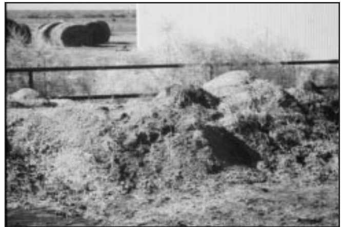
This stockpile of horse manure, straw and wood shavings is unsightly and, if uncontrolled, can pose a threat to water quality in nearby streams and ponds.

1. Aerobic. In the presence of air, or specifically oxygen, organic material degrades without creating problems associated with odor. Biological degradation that takes place without oxygen, or anaerobic digestion, is often called "fermentation." It usually is associated with intense and disagreeable odors.