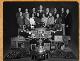
2013 National Champions