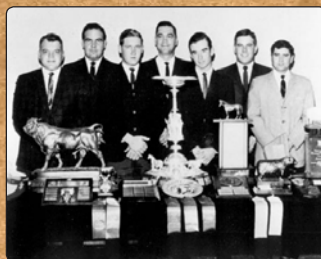
1967 National Champions