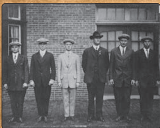
1913 International Champions