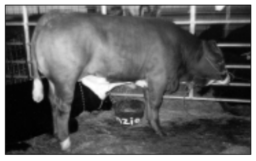
American (Brahman-influenced) breed steer, slaughter-ready.