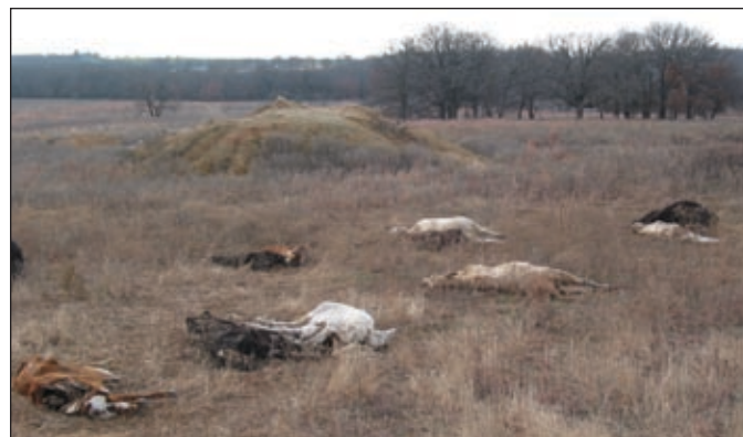
Figure 1. Leaving animal carcasses exposed to nature is not a good idea.

Every living being does best when it eats a properly balanced diet, and compost microbes are no exception. They need both carbon (C) and nitrogen (N) in the right ratio. Optimally, the nutrients in a compost pile should be about 30 parts C and 1 part N (30:1).