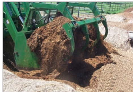
Figure 2. A front-end bucket/grapple loader is a versatile piece of machinery for depositing carcasses (left) on a compost pile and for building (center) and turning (right) the pile.