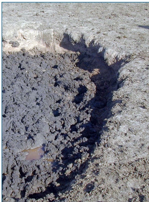
Figure 4: Although animal behavior and rainfall are the most obvious causes of wallows and holes, they may also be initiated by poor manure harvesting techniques that break into the underlying layers of the pen surface, expose caliche or clay palatable to the animals, and create areas that trap rainfall runoff.

fertilizer and/or biofuel value of the harvested manure (Fig. 4).