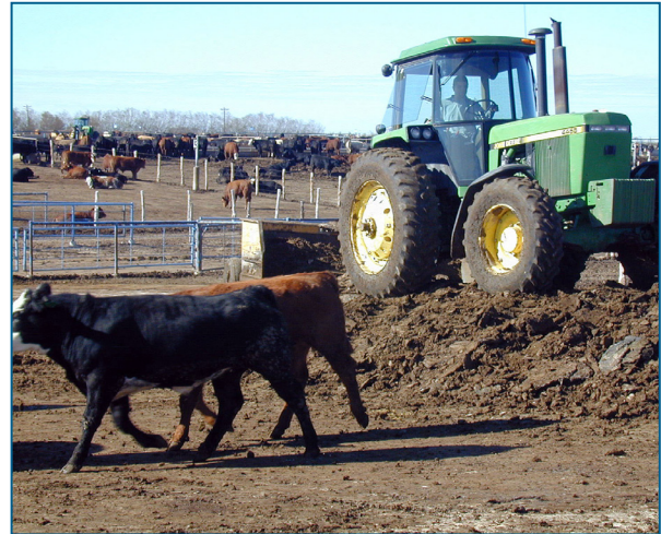
Figure 3: Harvesting manure from populated pens improves pen conditions in feedyards with little effect on cattle health or performance. Note that the pen surfaces in the background are hard, smooth, and well drained.

When using mounds for seasonal manure storage and/or enhanced drainage, the manure should be moistened to 20 to 30 percent and compact it in place with a front-end loader or other wheeled machinery. (Track-driven tractors don't produce the desired degree of compaction.) The upper limit on the amount of water to add so the uncompacted, harvestable manure reaches