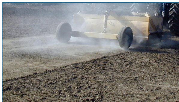
Figure 5: Box blades are effective at maintaining a smooth, hard pen surface without gouging the interfacial layer and exposing mineral soil. The manure being harvested in this photo will have a higher heating value of about 5,000 Btu/lb (British thermal unit per pound) as collected and would be considered a relatively high-value biofuel feedstock.

Manure harvesting equipment run by trained, skilled operators should be capable of leaving about 1 to 2 inches (2 to 5 centimeters) of hard, smooth, and evenly sloped manure/soil mixture over the underlying mineral soil. Different types of equipment vary in their effectiveness at ensuring rapid drainage and efficiently removing manure. Machinery intended for digging or scooping, such as a front-end or bucket loader, may make it more difficult to avoid gouging the pen surface through the underlying compacted layers of manure and soil. Box blades are pulled rather than pushed and can be more easily adjusted for penetration depth. Such features allow equipment operators to maintain an optimal pen surface. Once a box blade stacks the manure, a bucket loader may be used to remove the manure from the pile.