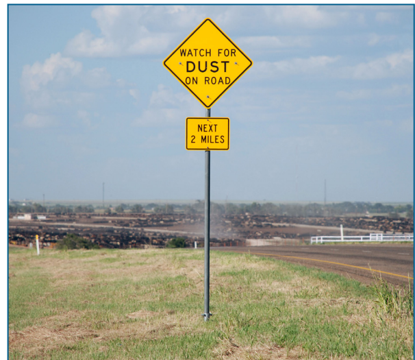
Figure 1: Dust generated by open-lot CAFOs may reduce ground-level visibility on nearby roadways.

may be accompanied by a wide range of malodorous compounds, and is associated with reversible human health effects such as allergic reactions. It is also related to quality-of-life factors such as impaired visibility, unpleasant odors, limited outdoor activity, diminished sense of well-being, and reduced property value. Fugitive PM from cattle feedyards can reduce visibility to the extent that it interferes with both ground and air travel (Fig. 1).