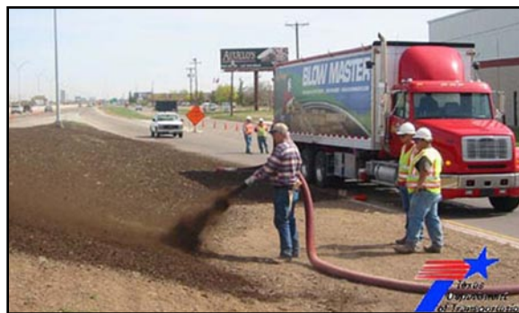
Figure 2. Grass seed and compost being applied as a compost blanket for erosion control and revegetation of a road right-of-way.

New federal storm-water-permit requirements for general construction activities and for municipalities have placed much greater responsibility on construction contractors and on local governments to put in place effective erosion and sediment controls. At the same time, recent research demonstrates the effectiveness of several practices that use compost to stabilize soil, reduce suspended solids and sediment in runoff, reduce chemical loads, and delay runoff onset and volume. Guidelines and specifications for use of compost in erosion and sediment control applications can be found in the Texas Commission on Environmental Quality (TCEQ) reference document BMP Finder at http://www.tnrcc.state.tx.us/water/quality/nps/nps_stakeholders.html#bmp%20finderD .