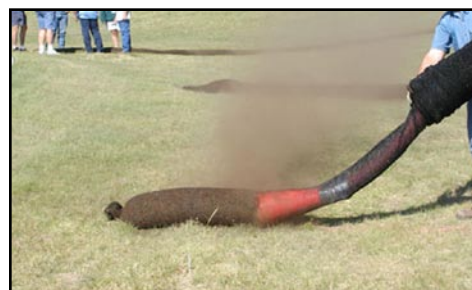
Figure 4. Compost and wood-chip mixture applied in a mesh casing as a filter sock to control runoff and sedimentation.

The Texas Department of Transportation (TxDOT) has used composted dairy manure, feedlot manure, chicken litter, cotton gin burs, yard trimmings, and municipal biosolids as compost blankets for hydroseeding road rights-of-way to control soil erosion from steep slopes (Fig. 2) and as filter berms to control erosion and sedimentation from low- volume runoff (Fig. 3). Recent projects have used filter socks rather than berms, because socks have a greater ability to withstand concentrated flows and to retain sediment (Fig. 4). Another applications at a West Texas municipal landfill uses compost produced from a mixture of poultry manure, sawdust and other wood residuals to control erosion, as a soil amendment and to create a vegetated cover over closed landfill cells.