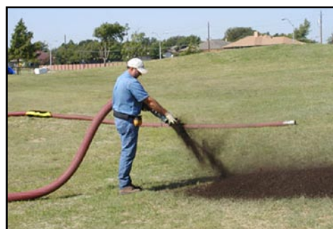
Figure 3. Grass seed and compost being applied as a filter berm to control runoff and sedimentation in a city park waterway.