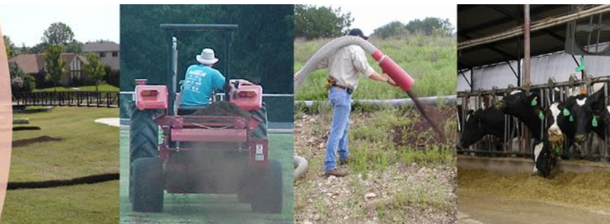
Dairy Compost Utilization

*Associate Professor and Extension Agricultural Engineering Specialist – Waste Management