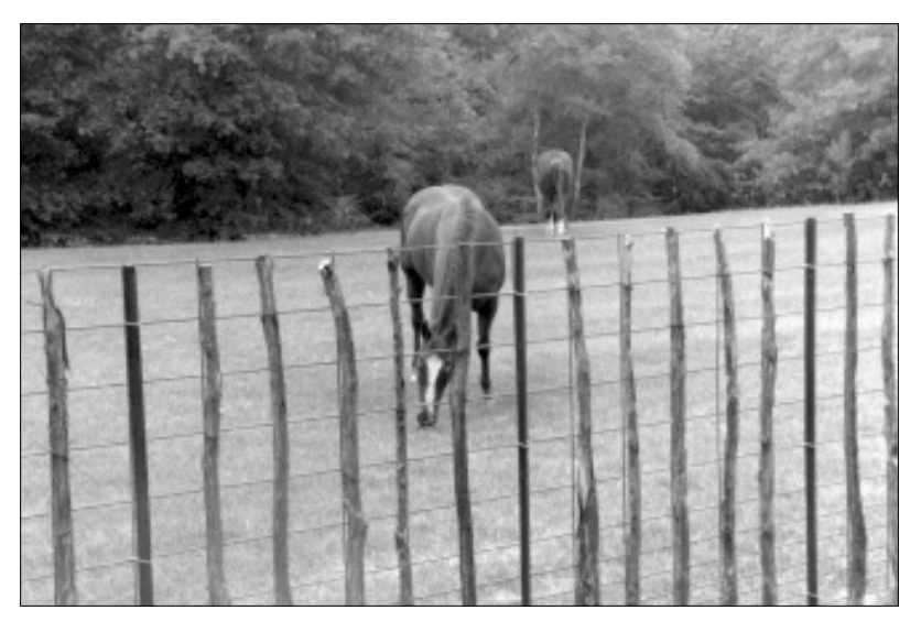
Well-built perimeter fences help secure horses and deter theft.

picture of the head. If possible, also take a rear view.