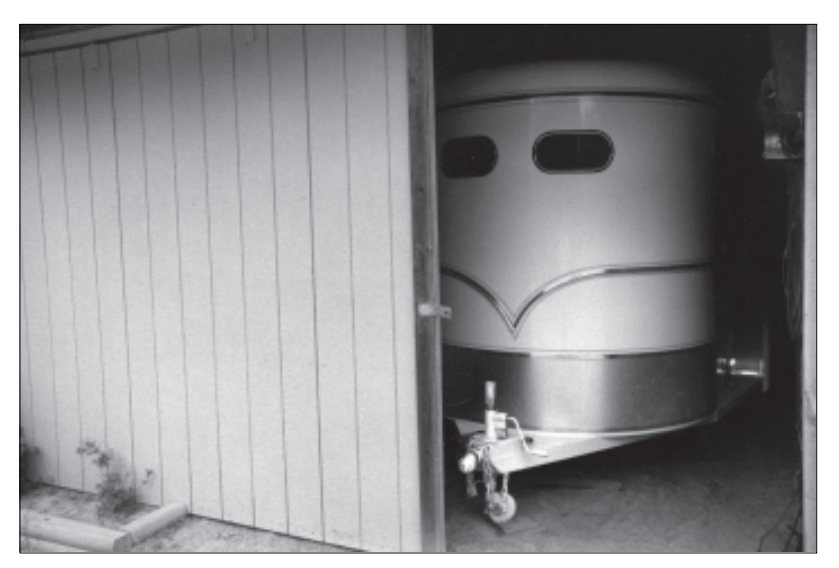
Park trailers where they are hidden from view.