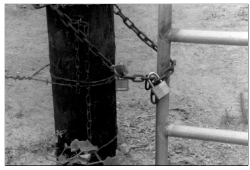
Lock gates to pastures that can be entered from the road.

Absentee owners sometimes don't realize for several days that their horses have been stolen from pastures.