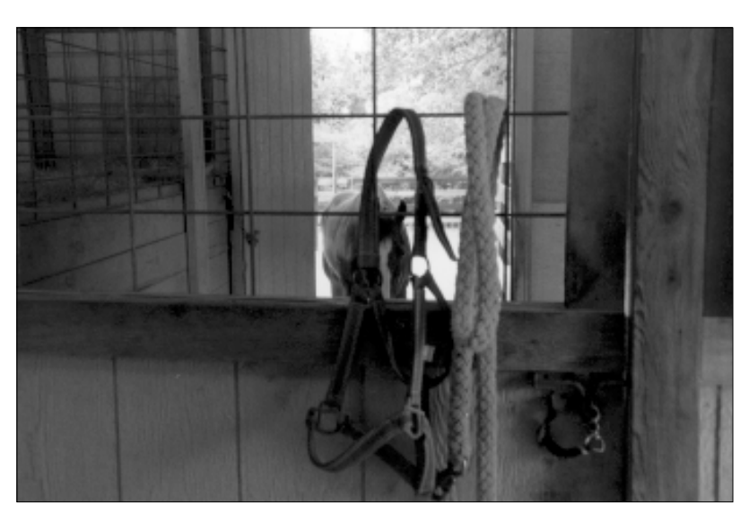
Deter theft by locking up halters and lead ropes.

Thieves dislike dealing with dogs. However, consider that dogs also require management.