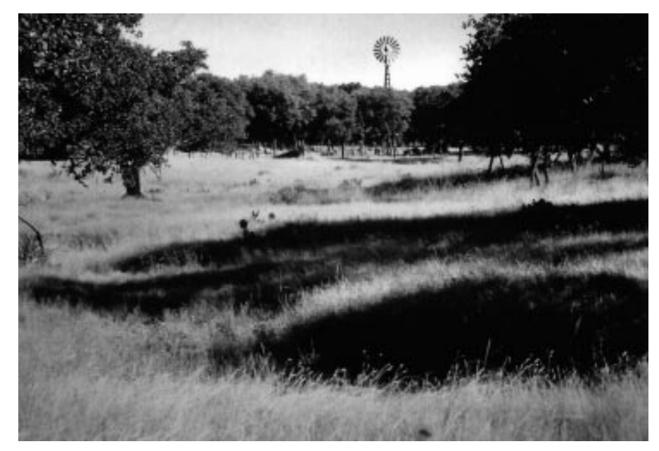
Figure 2. "Hiring" a good lessee who manages your property to meet your needs produces a stable range resource. A good lease is a viable opportunity for the lessor and the lessee.

management plan for the use of the property (Figure 2). This plan should reflect the goals of the landowner as well as the tenant and should include an initial inventory of resources. The resources available as well as the goals of each party must be understood if a proper lease is to be developed.