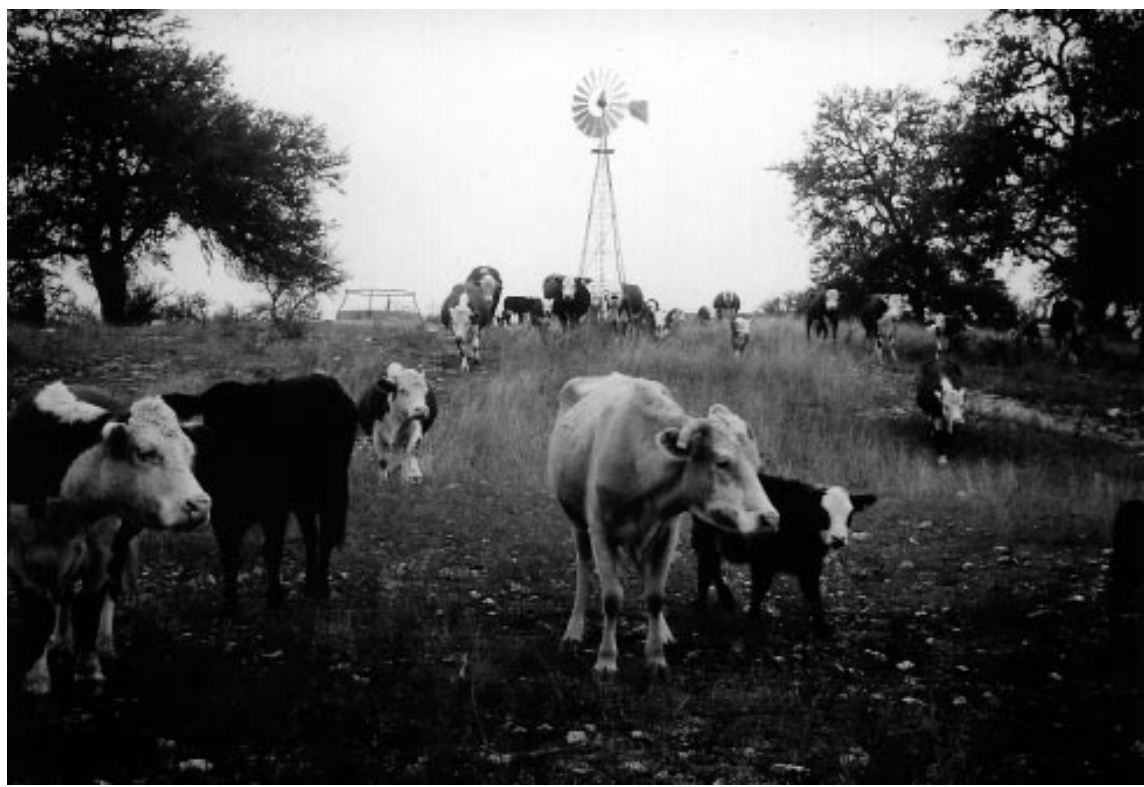
Figure 1. Poor management can result in destruction of the resource. A good lease should spell out adequate resource requirements and be priced so that a lessee is not "forced" into overgrazing to meet short-term debt obligations.