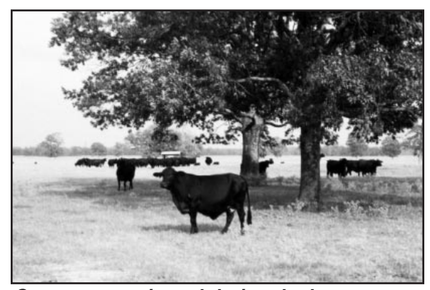
Cows are vaccinated during the last trimester of pregnancy.

Stress at the time of calving reduces resistance to disease. Infectious microorganisms of bovine respiratory disease (BRD viruses and pasteurella and haemophilus bacteria) can break out of dor-