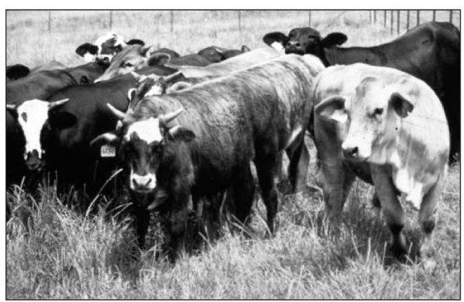
Preconditioned weanlings are destined to be stockers, feeders and replacements.

This calf preconditioning immunization concept for beef herds provides protection against infectious diseases through passive and active acquired immunity for unborn, nursing and weanling calves. It involves giving immunizations before and after the calves are born. The immunizations for the vaccination schedules for a beef herd should be determined by a veterinar-