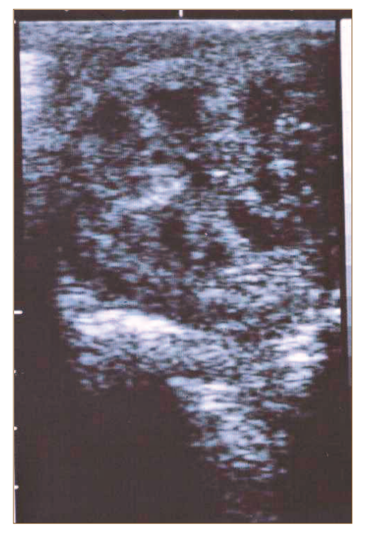
Ultrasonogram of the uterine horn of a mare in estrus.

• The mare should be receptive to the stallion. Although this generally coincides with increasing follicular growth, a small