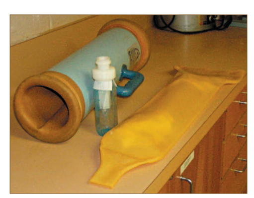
CSU model artificial vagina.

Each semen collection should begin by preparing the artificial vagina. It is much easier to apply lubricant to the inside of the AV before filling. Use a non-greasy, non-spermicidal, sterile lubri-