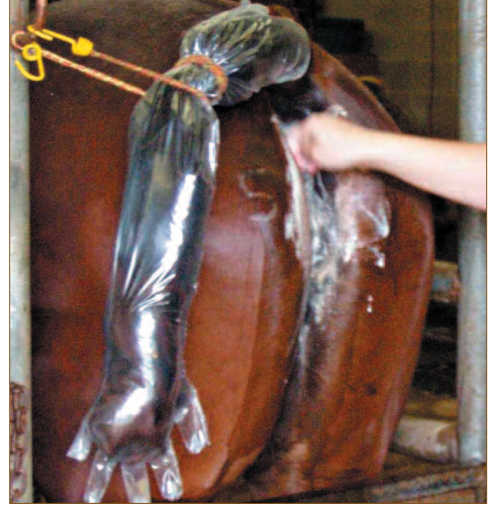
A mild soap can be used to wash the perineal area of the mare prior to insemination.

The extended insemination dose should be placed in a sterile, nontoxic, disposable syringe (Air-Tite<sup>®</sup>) and kept warm and protected from sunlight until deposited in the uterus of the mare. The