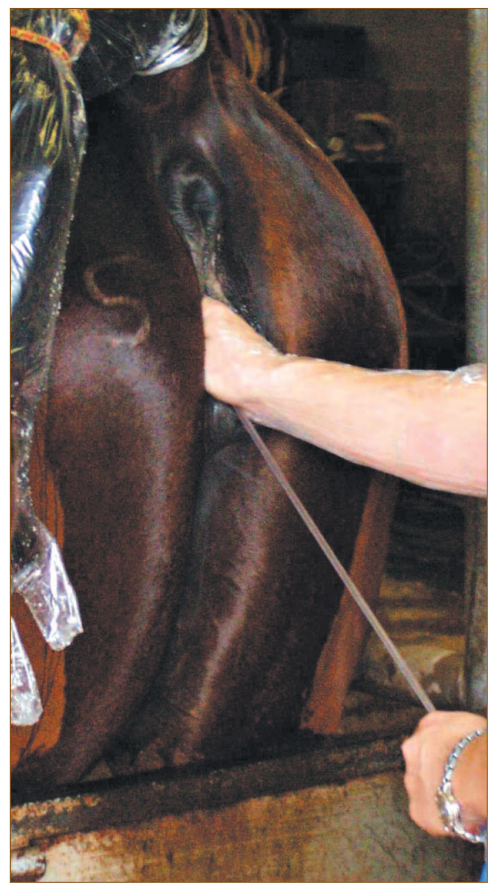
After insemination, the hand sould be slowly withdrawn in a downward motion to prevent aspiration of air into the vagina.