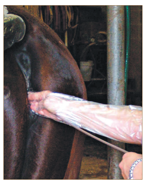
Proper position of hand with insemination pipette prior to insemination of mare.

With proper technical training, many horse owners can adapt their breeding facilities and programs to include AI. However, they must first decide whether the added costs and management commitment are offset by improved reproductive performance associated with AI. Both hands-on and technical training are required to perform AI successfully. Even minor errors in the use of AI technology can be detrimental to a breeding program.