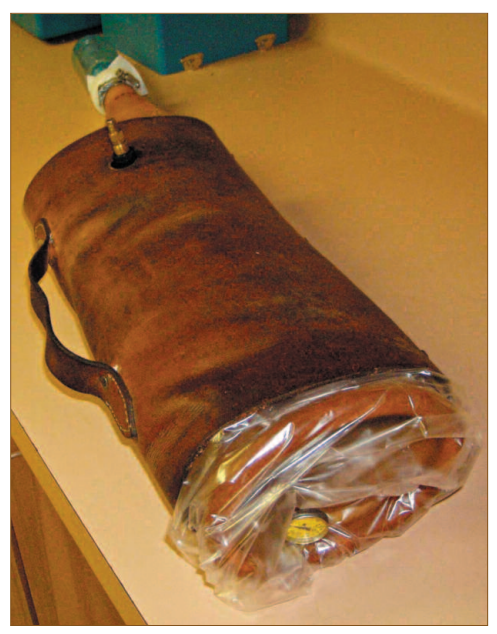
Missouri model artificial vagina (distributed by NASCO) being prepared for collection.

While waiting for the AV to reach proper temperature, the stallion can be brought to the collection area for teasing and washing of the penis. Many stallions become familiar with this routine and develop an erection as soon as they are brought to the collection area. This removes the need for a tease mare. Each stallion has its own preferences. Some may require more teasing for a complete ejaculation, while others may easily become over-stimulated to the point of becoming unmanageable or increasing semen volume too much.