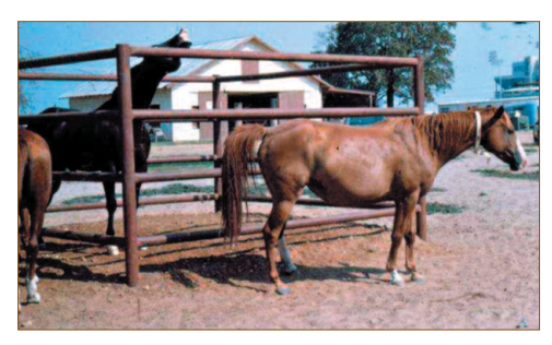
Estrus in mares can be detected by placing a stallion in a holding pen while the mares are allowed to exhibit behavioral signs without the influence of a handler.