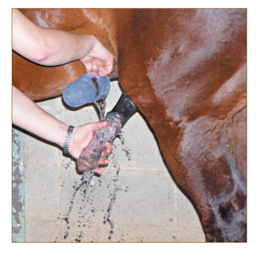
The washing process serves to clean the penis and prepare the stallion for the semen collection. The stallion should not be handled roughly during washing.

Collecting the semen is the next step in the AI process. If some time has elapsed between washing and collection, the stallion may have to be teased again to attain an erection. He should be led in