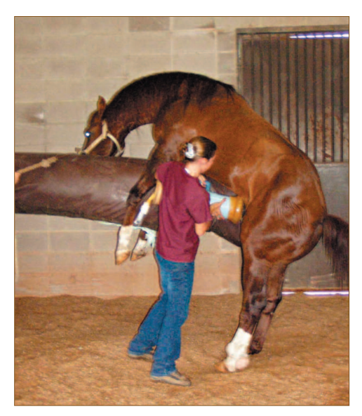
Semen collection into a CSU model AV using a phantom. Note the position of the AV during the collection.

Caution: Stallion handling and semen collection should not be attempted by persons not experienced in handling horses. It should always be done under the direct supervision of an experienced and knowledgeable person who understands the procedure very well.