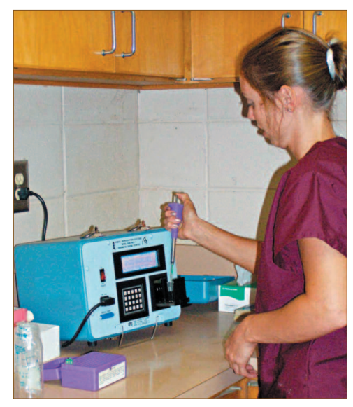
Evaluation of spermatozoal concentration in an ejaculate with the Densimeter<sup>®</sup>.

To calculate an insemination dose, the concentration of spermatozoa in the ejaculate must be determined. Several instruments are available for this determination with a wide range of costs and capabilities. The least expensive is a hemacytometer, used with a microscope to count actual cells. The most widely used instrument is the Densimeter<sup>®</sup> (Animal Reproduction Systems, Chino, CA), which can also calculate the insemination dose. Several other less expensive sperm counters are reliable for determining spermatozoal concentration, but they have fewer features than the Densimeter<sup>®</sup>.