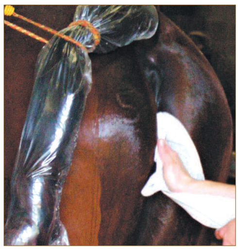
Water is spermicidal so it is suggested that the mare be dried before insemination.