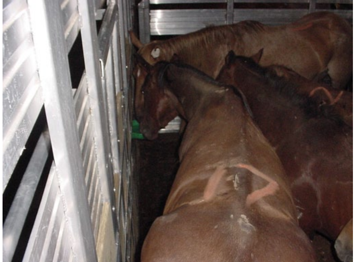
This is an actual commercial shipment of slaughter horses used to test a watering system that was developed with USDA for possible use during extremely long shipments. Miniature body temperature loggers and 12 video cameras were used to record data during transport. These trials resulted in nine scientific journal articles and two review articles from Texas A&M University that provided a basis for the United States and Canada regulations for the commercial transport of horses going to slaughter.

Editor's Note: Part II of this series will appear in next week's issue of Animal Science Weekly and will present data on the horses transported to Mexico and Canada for slaughter and discuss options for disposing of unwanted horses.