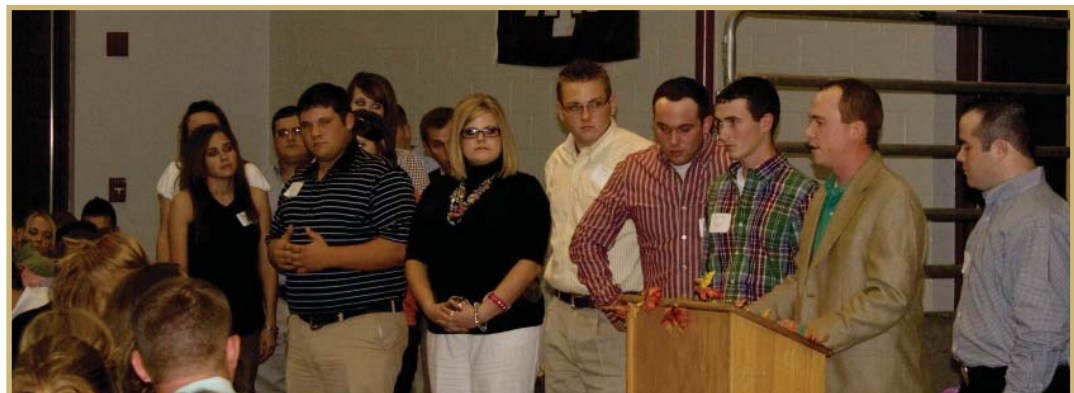
THE TEAMS - The junior livestock judging team, above, was one of the many competitive teams introduced during the program.