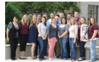
ALEC Graduate Assistants 2013-14